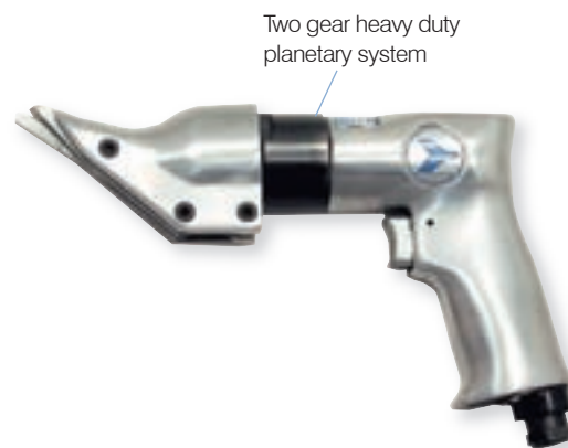
Two gear heavy duty planetary system