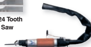
ARS112 Complete with air whip & muffling hose