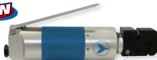
Head rotates 360° for ease of use