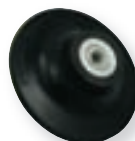
502997 - 2" Pad 502998 - 3" Pad (standard)

Standard Accessories: 3" x 1/4-20UNC back-up pad - 1 (502998), 2" x 1/4-20UNC back-up pad - 1 (502997)