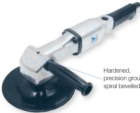
Hardened, precision ground spiral bevelled gears

Standard Accessories: 3" Backing plate ( 905301 ), 4-1/2" Backing plate ( 905302 ) and 5" Backing plate ( 905303 ); Holding tool ( 905304 ), Nut ( 905305 )