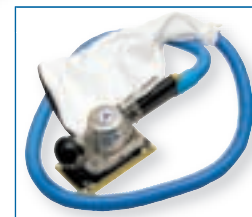
OS37SG Self generated dust collection system