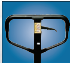
3 position control lever for operator convenience