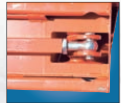
Fully adjustable push rods