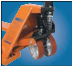
Totally sealed H.D. hydraulic unit Steel wheel wrapped in polyurethane